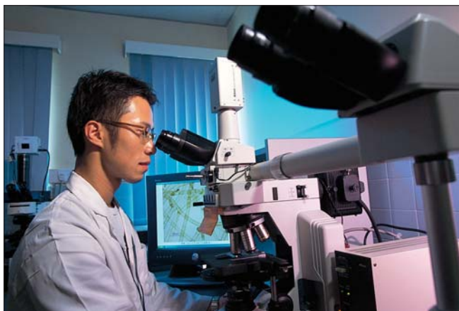
Figure 2. Close monitoring of Giardia and Cryptosporidium.

In addition to more aggressive SPC use, the WSD required additional statistical functions including tracking, evaluating and charting QC data by each of sixteen separate analytical “teams”. Samples were assigned to qualified team members before any analysis was performed. Analysts had to be able to: